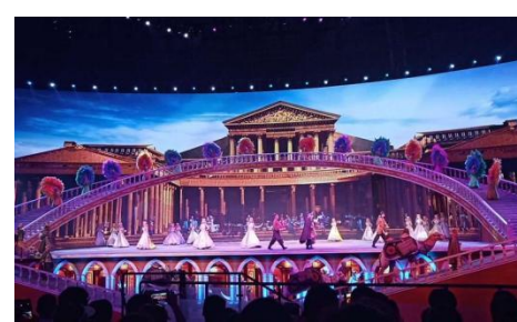
Huashan Scenic Area