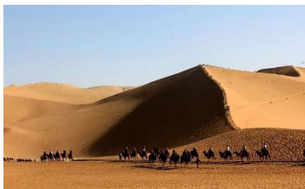
Singing Sand Mountain