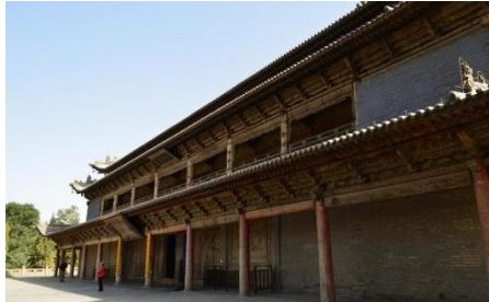
Great Buddha Temple