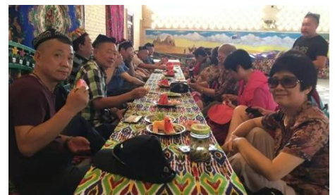
Weiwu'er Ancient Village visit