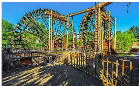
Yellow River Mill Park