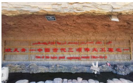
Karez Irrigation System