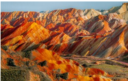
Danxia Landform National Geological

visit Zhangye Danxia Landform National Geological Park Great Buddha Temple (inclusive of interval car) which is also known as the eye candy of Zhangye. Many artists envy this masterpiece as it appears like a perfect painting on canvas. After that coach to visit the Jiayuguan Tower (including tram ride). It was once an important component in the medieval military defense system and considered the starting point of Great Wall. After that, back to Jiuquan. Savor steam pot chicken for dinner