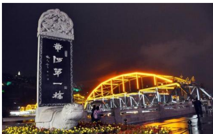
Yellow River Bridge

Today visit Yellow River Bridge , the first bridge built on the upstream of Yellow River. After which, visit Yellow River Mill Park and Mother of Yellow River Sculpture . After that coach ride to Wuwei