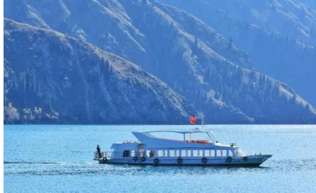
boat ride on Tianchi Lake