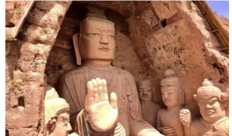
Great Buddha Temple