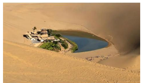
Crescent Moon Spring