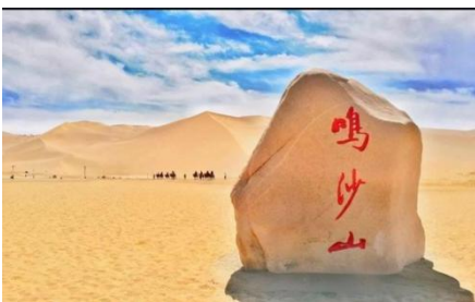
Singing Sand Mountain

After breakfast, coach to Dunhuang city. Upon arrival, visit the " Singing Sand Mountain ", which is a desert area, coupled with the undulating sand mountain, clear spring water, and the scenery is unforgettable,be awed by the magnificent sight of Crescent Moon Spring (including tram ride, Shoe cover), an oasis named for its crescent-shaped pond. Collect fortune sand. Enjoy Dunhuang performance on your own expenses.Note: Tonight, your larger luggage will be arranged for logistics shipping to your hotel in Turpan.