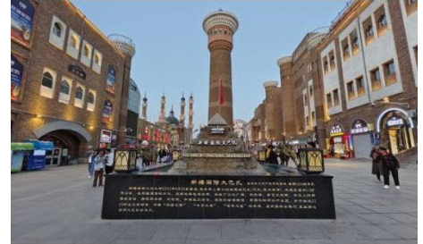
Urumqi International Bazaar