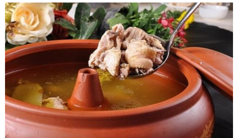
steam pot chicken