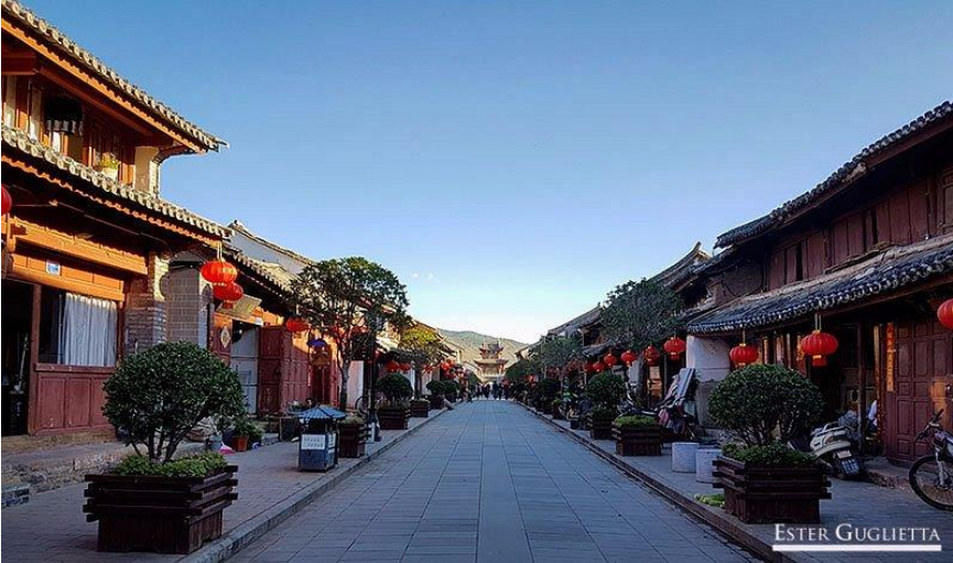
Weishan Ancient City