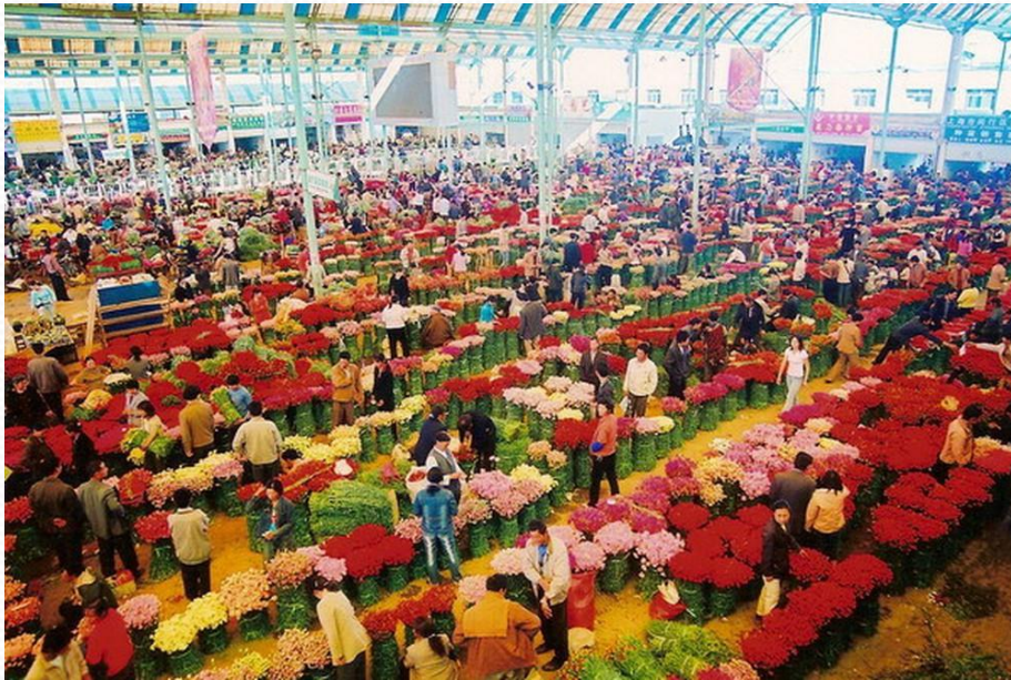
Dounan Flower Market