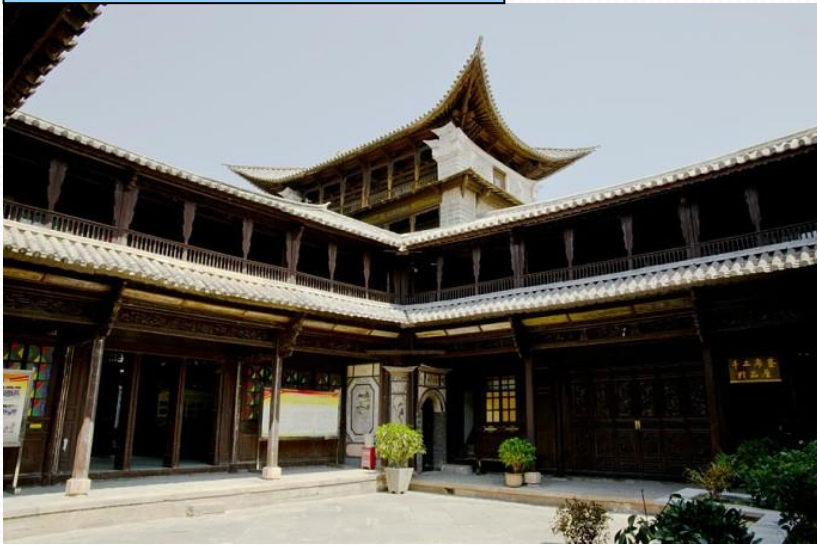
East Lotus Village