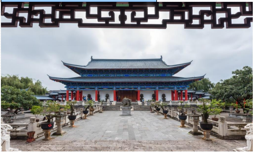
Ma Ruji Courtyard