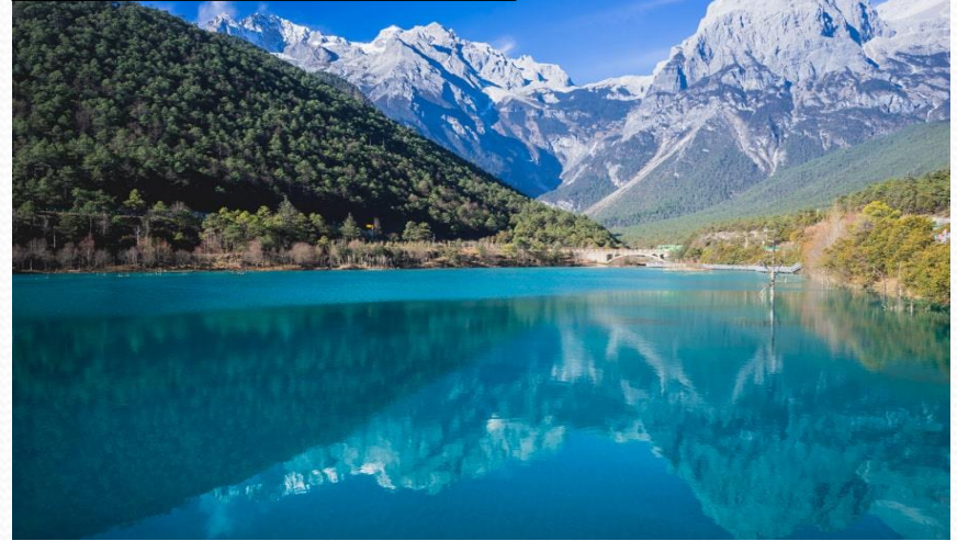
Blue Moon Valley