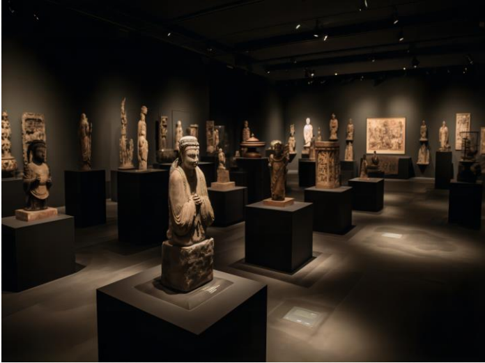
Weishan Nanzhao Museum