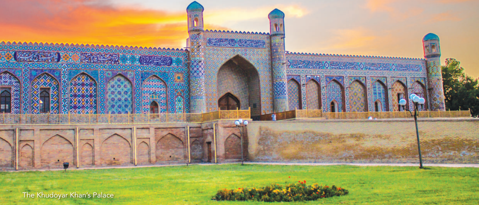
The Khudoyar Khan's Palace