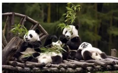
Panda breeding base