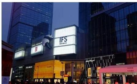
IFS Shopping Mall