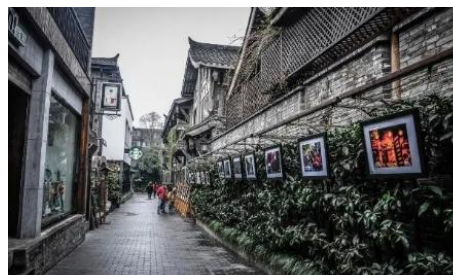
Broad and Narrow Alley