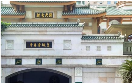
Imperial City Mosque