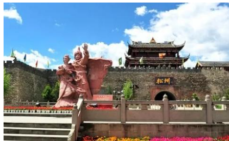
Songpan Ancient City