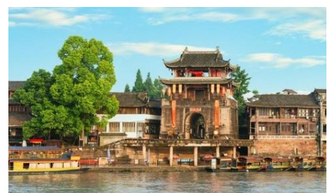
Huanglongxi ancient town

DAY 8 CHENGDU (Breakfast, No tour guide and car) STAY:LOCAL 5 STARS XIN LIANG HOTEL OR SIMILAR CLASS Free day at Chengdu. Independent travel recommended: There are many clothing, food, and theme stores in the shopping mall. Hotel is located near the train station and you can travel to other parts of Chengdu on your own easily. You can enjoy Sichuan meals and snacks in the shopping mall at your own expense.