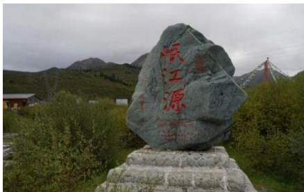
Source of Minjiang River

Transfer to High-speed Railway station, then proceed to Zhenjiangguan by high-speed railway. (Reference time and shift: C6376 10:30-12:21). After arriving at Zhenjiangguan, take a bus to Gonggangling, which is located on the border of Songpan County and Jiuzhaigou Valley in northwest Sichuan- the Source of Minjiang River . Then go to Songpan Ancient City , The ancient city is grand in scale and extraordinary in momentum, known as the "western Sichuan gateway", where the largest number of Muslim people live in Aba prefecture. back to the hotel after visit, participate in Jiuzhaigou Tibetan and Qiang party at your own cost in evening.