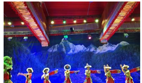
Jiuzhaigou Tibetan and Qiang party