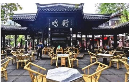
Heming Teahouse in People's Park

DAY 7 CHENGDU (Breakfast/Lunch/Dinner) STAY:LOCAL 5 STARS XIN LIANG HOTEL OR SIMILAR CLASS After breakfast in Chengdu, go to Heming Teahouse in People's Park . There are many tea shops in Chengdu. The Heming Teahouse, established in 1923, can be called the leader in the industry. Then go to the Panda breeding base (including sightseeing bus) to see the pandas up close. After lunch, go to Huanglongxi ancient town for a visit.